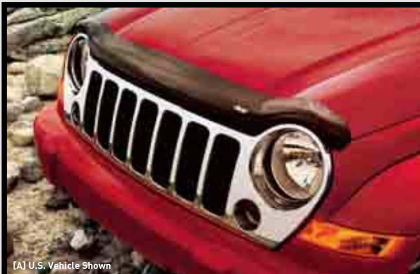
[A] U.S. Vehicle Shown