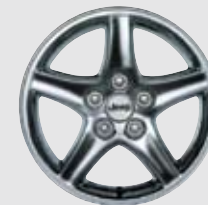
16x7-inch 5-Spoke Polished Cast Aluminum Wheels

Mopar Premium Wheels are machined to match your vehicle's hubs exactly so they'll run true and balance easily for a smooth ride. They also undergo stringent testing to prove their durability and ensure a long-lasting sparkle.