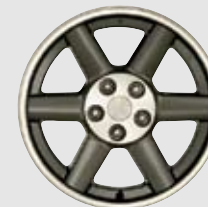
17x7.5-inch 6-Spoke Graphite Wheels