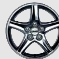
16x7-inch 5-Spoke Chrome Cast Aluminum Wheels

[T] Spare Tire Covers add a stylish touch to your Liberty. The Premium Covers are available in a variety of unique Jeep Brand designs. All Premium Covers are made of a cotton/polyester blend with heavy-duty stitching and feature an elastic anchor to securely hold the cover on the tire. The Hybrid Cover features a hard plastic moulded face and vinyl with an elastic wrap that fits securely around back and features the Jeep logo. Anti-Theft Covers also available.