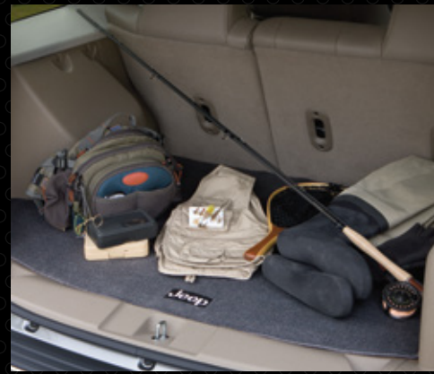
^ CARPET CARGO MAT TM Our premium mat is constructed of a durable nylon carpet to look good while helping to protect the cargo area from wear, soil and stains. Mat features reversible rubber backing for added versatility. Available in Slate Grey.