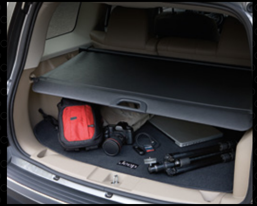
✓ CARGO AREA SECURITY COVER. TM Tough vinyl cover keeps your valuables out of sight in your cargo area. Cover removes easily for cleaning. Available in Pebble Beige and Slate Grey.