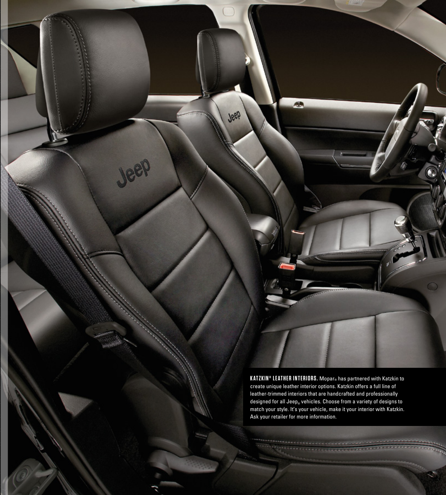
KATZKIN® LEATHER INTERIORS. Mopar® has partnered with Katzkin to create unique leather interior options. Katzkin offers a full line of leather-trimmed interiors that are handcrafted and professionally designed for all Jeep® vehicles. Choose from a variety of designs to match your style. It's your vehicle, make it your interior with Katzkin. Ask your retailer for more information.