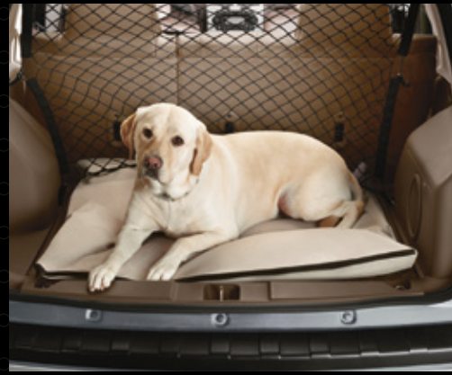
✓ VERTICAL CONVENIENCE NET. Made of durable Black nylon, our Vertical Convenience Net helps keep your pet from entering the rear seat and passenger area.