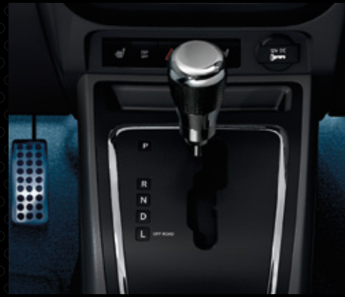
✓ SHIFT KNOB. Add a dose of high-tech style to enhance the interior of your Patriot with this custom accessory. Installing is a breeze – all hardware is included; for automatic transmissions only.