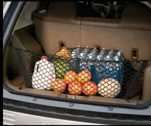
^ FLOOR CONVENIENCE NET AND ENVELOPE NET TM These sturdy Black nylon nets are custom designed to fit the cargo area of your Patriot and are sold together as a kit. Both nets remove easily when extra storage space is needed and are designed to fasten to tie-down loops for keeping loose items secure.