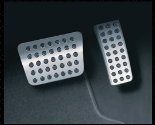
^ BRIGHT PEDAL KIT. Stainless steel pedal covers add plenty of bold brightwork to your footwell. Rubber on pedals provides contrast and positive traction. TM Properly secure all cargo.