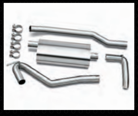
∼ CAT-BACK EXHAUST SYSTEM.<sup>(5)</sup> This system features T304 stainless steel construction with mandrel-bent tubing, stainless band clamps and polished tips. This free-flow system helps to provide horsepower and torque gains, improved fuel efficiency and a deeper tone.