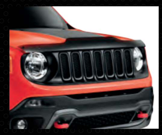
AFRONT AIR DEFLECTOR. Stylish deflector creates an airstream AVEHICLE COVER. Protect your vehicle's finish from UV rays, to help direct road debris, dirt and bugs up and away from your vehicle's hood and windshield. It features the Jeep, brand logo heavy-duty cover. Contoured cover features the Jeep, brand and is available in Smoke.