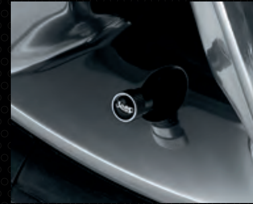
Renegade wheels a real twist. It's a small touch that offers large style cues, with the Jeep brand logo prominently displayed on precisely pre-cut to fit the contours of your vehicle, will help the top. Sold as a set of four.