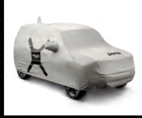
dirt and other pollutants with this washable, weather-resistant, logo, double-stitched seams and elasticized bottom edges at front and rear.