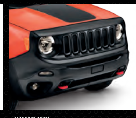
~ FRONT END COVER. This cover helps protect your front end against bugs, dirt and other road debris. Designed to securely fit the contours of the front end, and provides a licence plate opening. Trailhawk® model features tow hook openings (shown).

✓ ALL-WEATHER MATS. These custom-fit heavy-duty mats feature your vehicle's carpet. Sold as a set of four. Front mats feature the Jeep<sub>®</sub> brand logo.