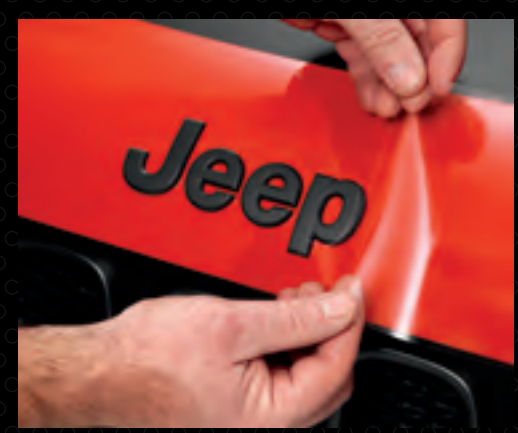
A TRANSPARENT STONE CHIP PROTECTION FILM. Protect your vehicle's paint finish with our paint protection films. Kits are protect it from bugs, dirt, scratches, etc., and will cause no damage to your OEM paint if removed years later. Retailer installation required.