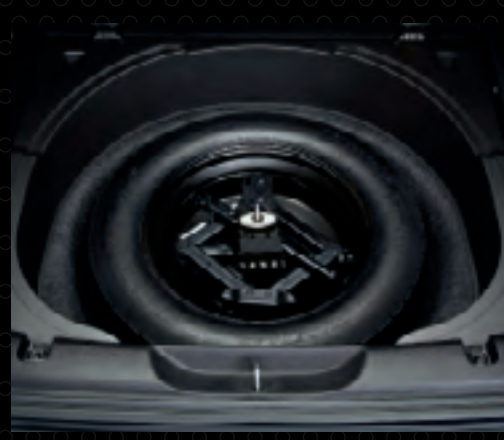
~ SPARE TIRE KIT. Who needs a tow truck when you can be your own pit crew? This kit has all the right tools to help make installing a spare tire easy and convenient.