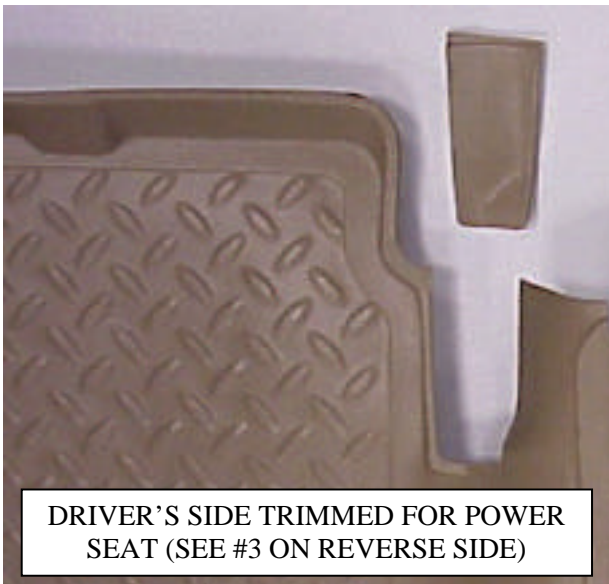
DRIVER'S SIDE TRIMMED FOR POWER SEAT (SEE #3 ON REVERSE SIDE)