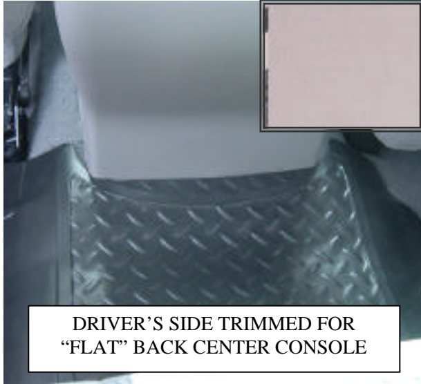
DRIVER'S SIDE TRIMMED FOR "FLAT" BACK CENTER CONSOLE