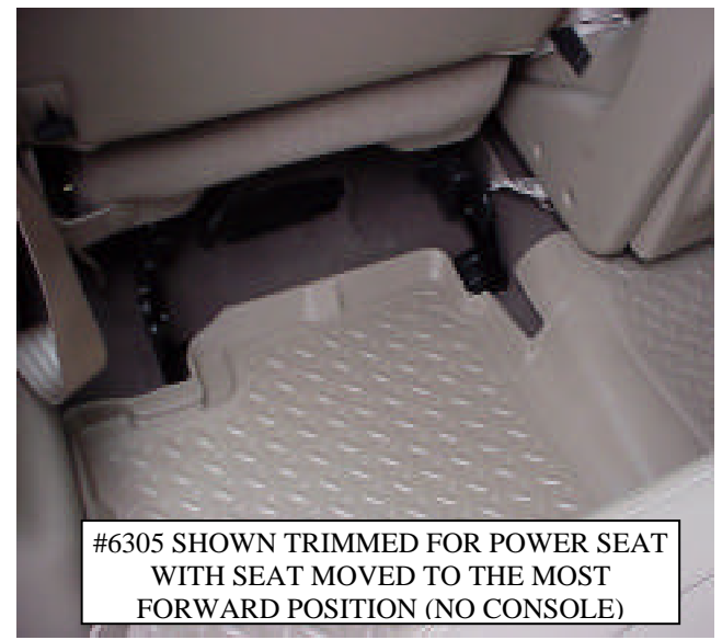
#6305 SHOWN TRIMMED FOR POWER SEAT WITH SEAT MOVED TO THE MOST FORWARD POSITION (NO CONSOLE)

IF YOUR FORD F-150 SUPERCREW IS EQUIPPED WITH REAR BUCKETS SEATS AND A REAR CONSOLE, YOU NEED HUSKY LINER PART NUMBER 6306. PLEASE CONTACT YOUR RETAILER AND LET THEM KNOW YOU HAVE THE WRONG PART NUMBER OR CALL US AT 800-344-8759.