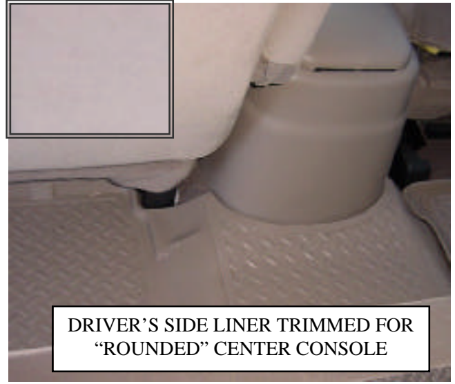
DRIVER'S SIDE LINER TRIMMED FOR "ROUNDED" CENTER CONSOLE