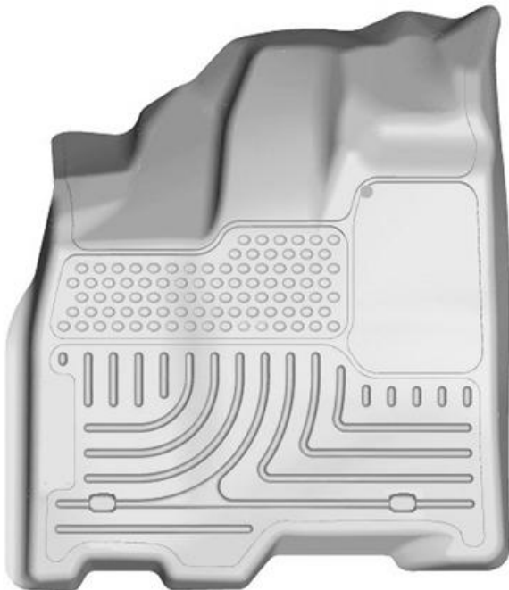
LEFT OR DRIVER'S